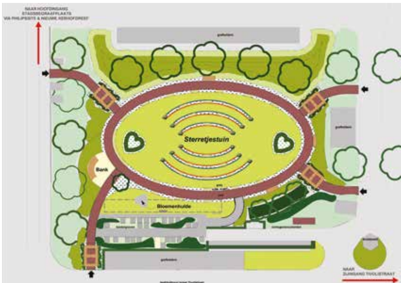
The 'Little Stars Garden' in Leuven