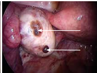
endometriosis lesions on an ovary