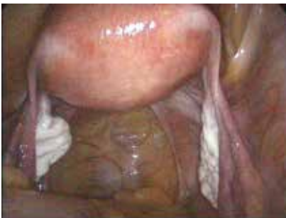
normal abdominal cavity with uterus, ovaries, oviducts

Left untreated, endometriosis can lead to infertility.