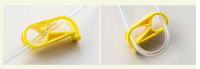
The tube is closed by the clamp.